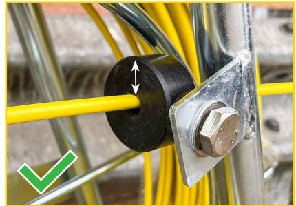
The material should be at least 5-8mm thick.