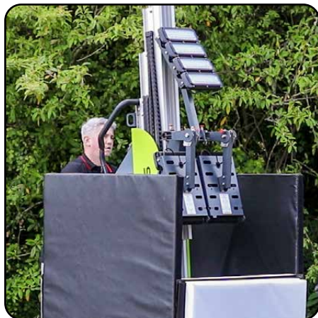
11. Raise the Quad Pod mast so the light heads clear the top of the padding when setting up (around 1.6m height)