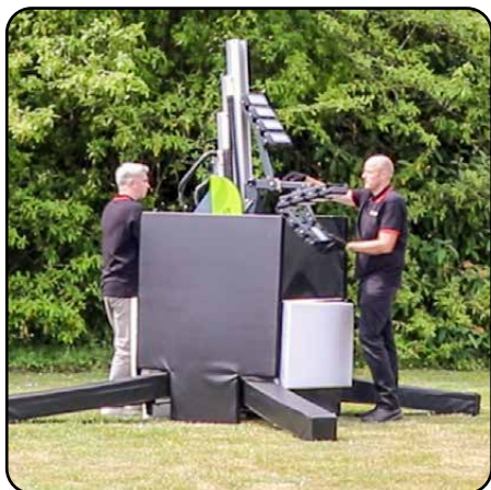
2. Lower front flap down to ensure light heads can stow inside padding kit and lower mast fully.