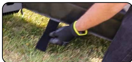
4. Undo the 3 velcro fasteners per leg and remove these from unit.