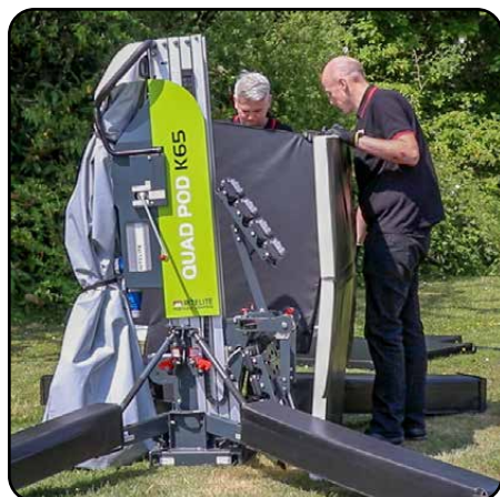
3. Remove all 4 sides to padding kit by separating the velcro at each corner.