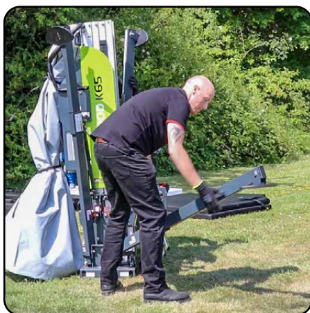
6. Lift legs up to their storage position.