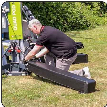
5. Place each leg pad over each leg ensuring the red pins are covered and the leg end cap protector is mounted up against the end of each leg. If you have the standard K65-PROTECT kit with padding for two legs, apply the leg pads over the two legs facing the playing area. If you have the K65-PROTECT360 kit all legs can be covered.