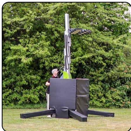
1. Fold rear flap down to gain entry to the winch area and lower mast so the light heads clear the top of the padding (around 1.6m).