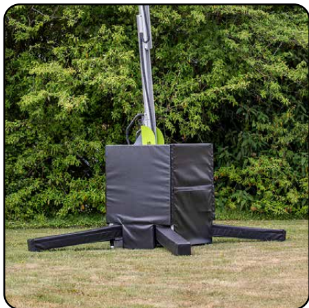
12. Setup light heads and fold the flaps back up and secure to the unit once mast is fully deployed. Setup is now complete.