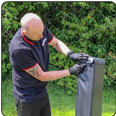
4. Fold each leg pad to create a 'U' shape and fit the end caps with the velcro.