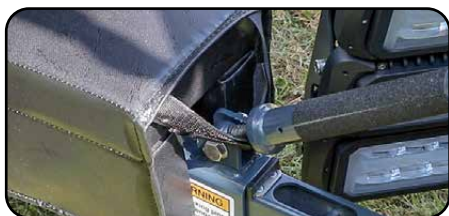
6. Secure to the leg using the 2 x lower velcro strips provided underneath the legs. Secure the top velcro strip around the Quad Pod's tie bars. This ensures the padding is secure to the unit and cannot slide down the leg.