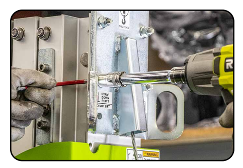
12. Tighten all four bolts in existing holes with the impact wrench. They should be torqued to 20nm and must not exceed this. Hold the bolts in place with the 5mm allen key on the inside of the mast.