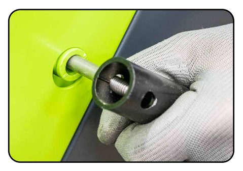
2. Pull each handle section outwards from the mast and pull down to remove from the threaded bar.