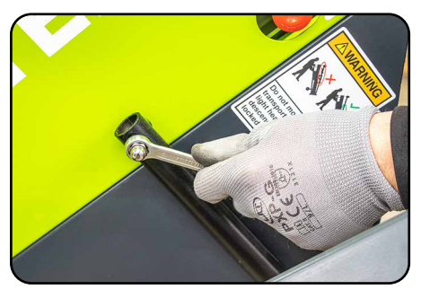
1. Place a 13mm spanner on each side of the black transport handle. Remove both nuts and washers from each side.

If you are unable to proceed to fit the QP-119A kit then please contact us at sales@ritelite.co.uk. We can then arrange a solution for you.