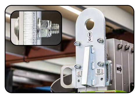
11. Put the replacement lifting plate in place, fit new bolts, washers and nuts to the top four holes. The washers should be between the bolt head and the aluminium mast.