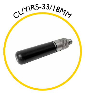
Mini sonde 33kHz 18mm