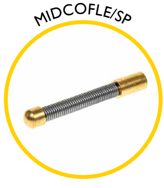
Flexi end spring for 6mm rod