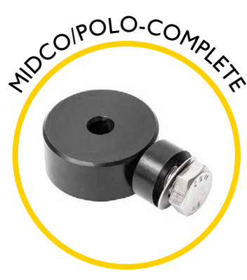
Rod guiding eye, complete