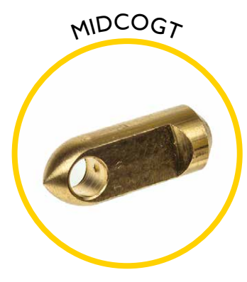
Guide tip for Midi Cobra