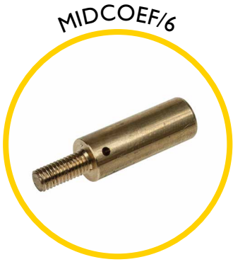
End fitting for 6mm rod