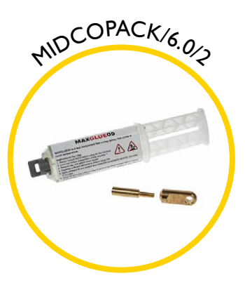
Replacement end fitting repair kit