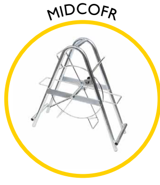
Midi Cobra replacement frame and reel