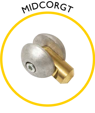
Roller guide tip