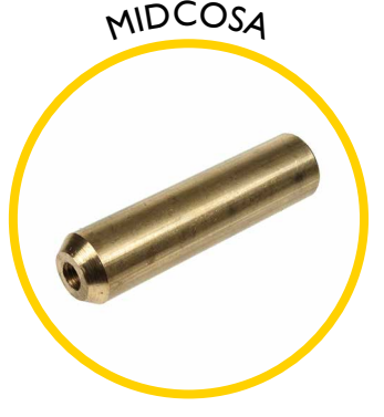
Sonde adaptor M5 to M10 female