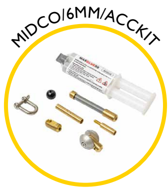
Accessory kit including various fittings for additional functionality