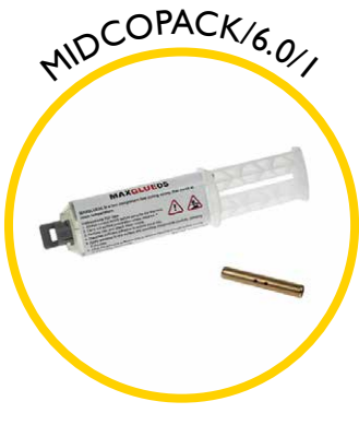
Splice repair kit for repairing broken rod