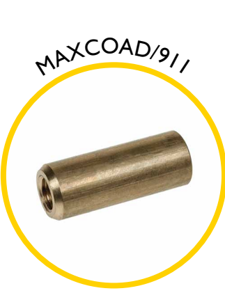
Sonde adaptor M12 to M10 female