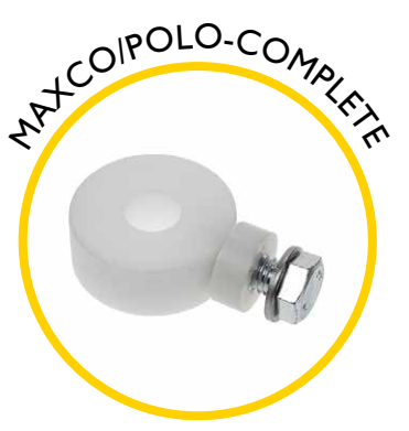
Rod guiding eye, complete