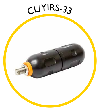
Sonde 33kHz 38mm