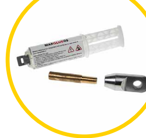
Replacement end fitting repair kit