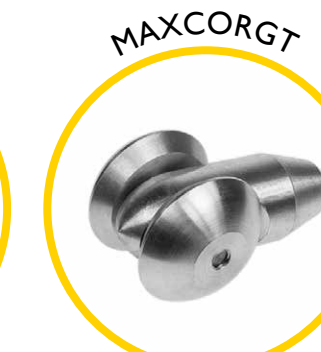
Roller guide tip