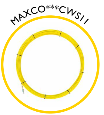
Replacement I I mm rod at a length of your choice