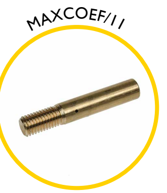
End fitting for 11mm rod