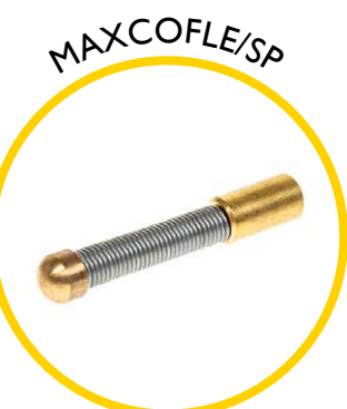
Flexi end spring for 11mm rod