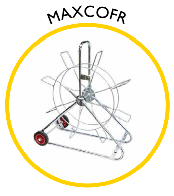
Maxi Cobra replacement frame and reel