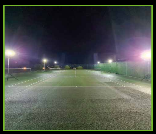
6 kit Junior training on twin court or adult training on single court