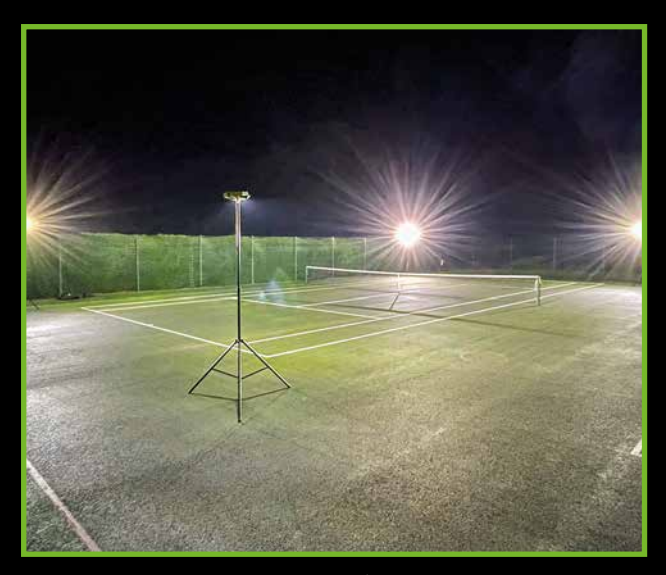
4 kit Junior training on single court