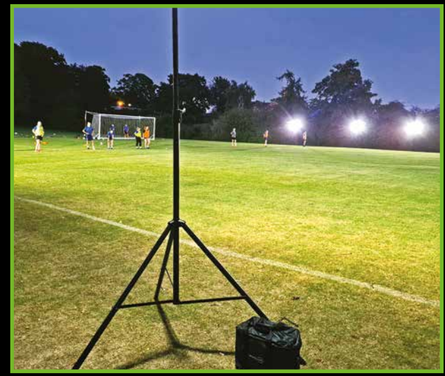
6 kit 1/3 full pitch