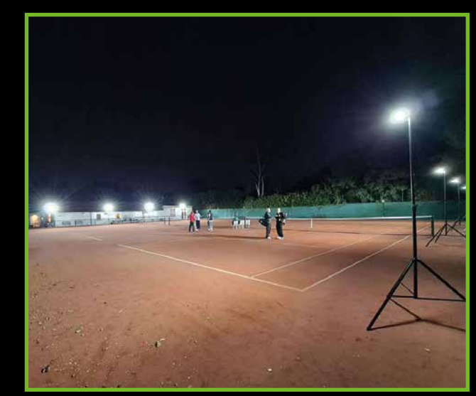
8 kit Adult training on twin court or pro training on single court