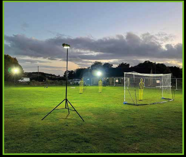
4 kit 5-a-side pitch