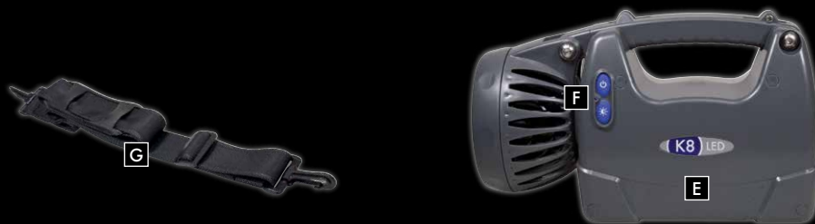
Adjusting Beam from Spot to Flood

G K8 comes complete with heavy duty carry strap as standard.