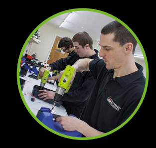
BRITISH MANUFACTURERS FOR OVER 35 YEARS