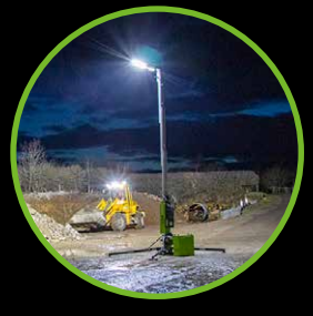
EXPERTS IN LED TECHNOLOGY & POWER EFFICIENCY