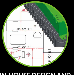
IN-HOUSE DESIGN AND DEVELOPMENT